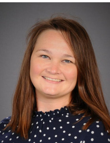
Term 4 Week 1